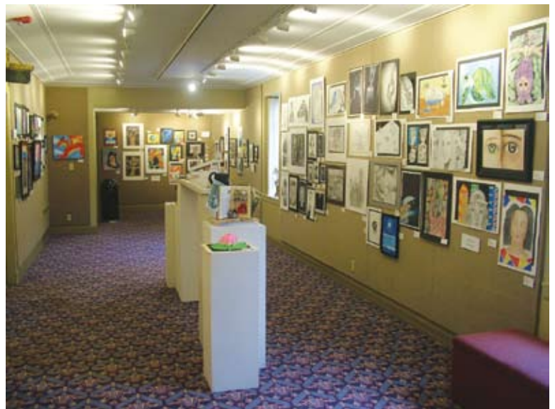
Pictured: 2019 Visual Art Achievement Awards Exhibit in the Junior League Gallery at the Bama Theatre