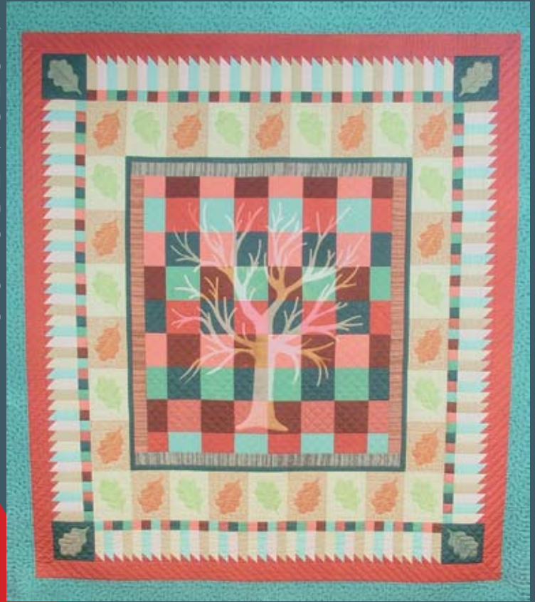
"October Glory" quilt installation on metal located at Government Plaza. Artist: Hallie O'Kelley