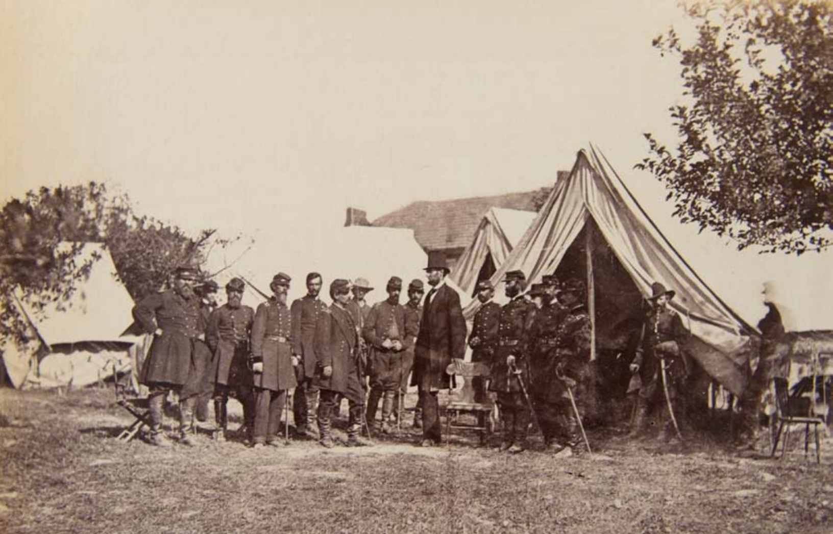
President Lincoln on the battlefield at Antietam, October, 1862