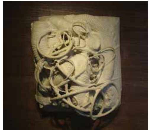
Artist credit: Sara Garden Armstrong

The annual Double Exposure Photography Competition and the West Alabama Juried Show were both cancelled due to COVID-19.